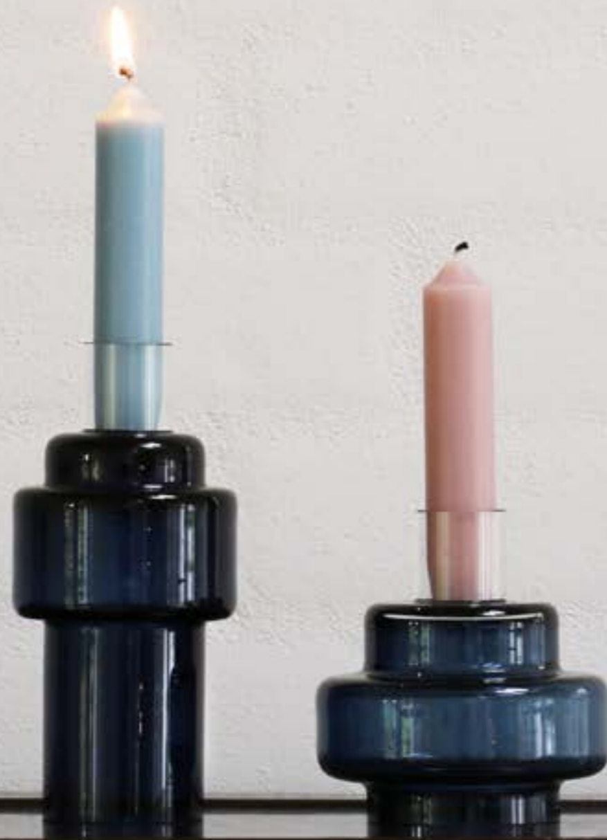
GLASS CANDLESTICK no. 54, 55 Indigo blue