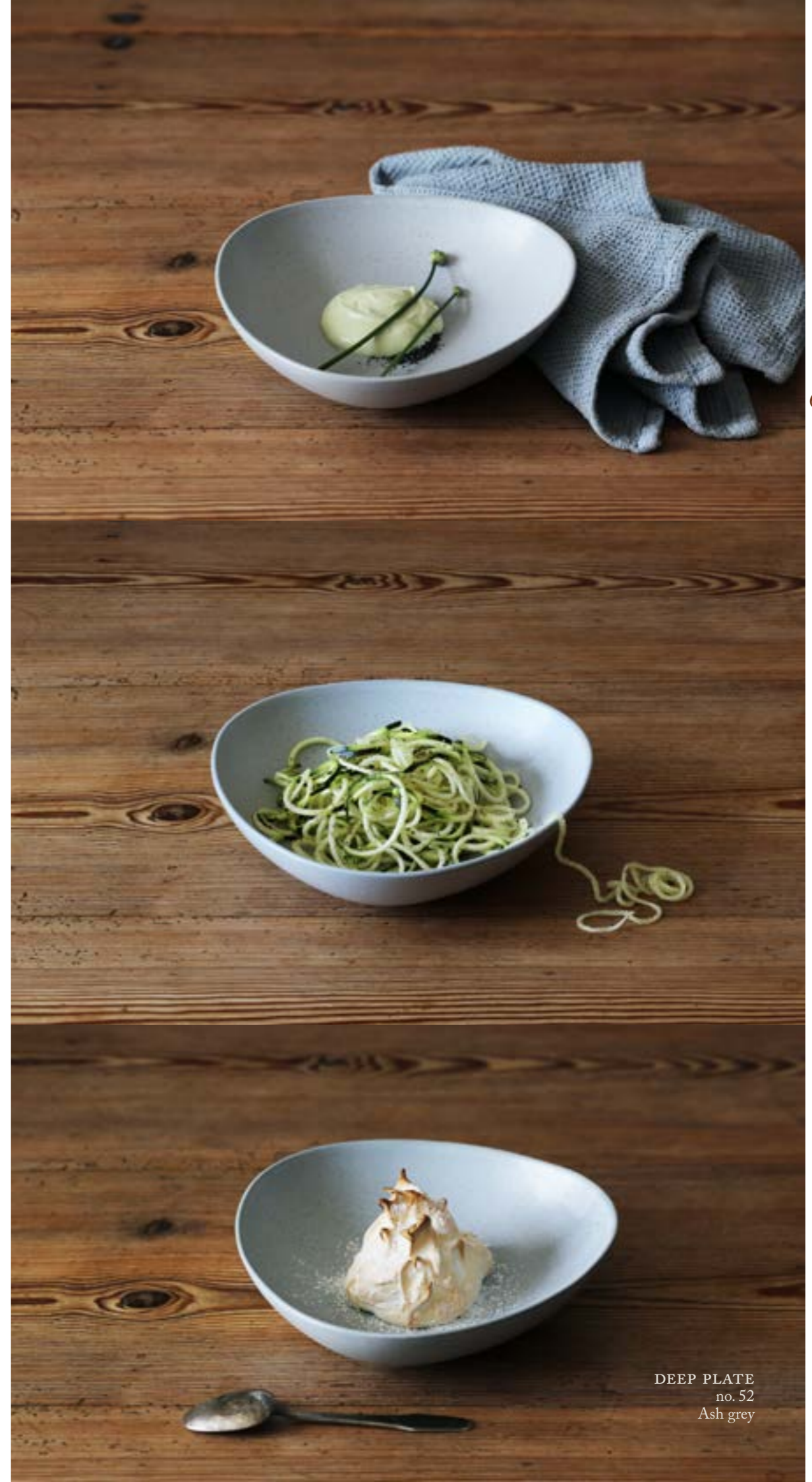
DEEP PLATE no. 52 Ash grey