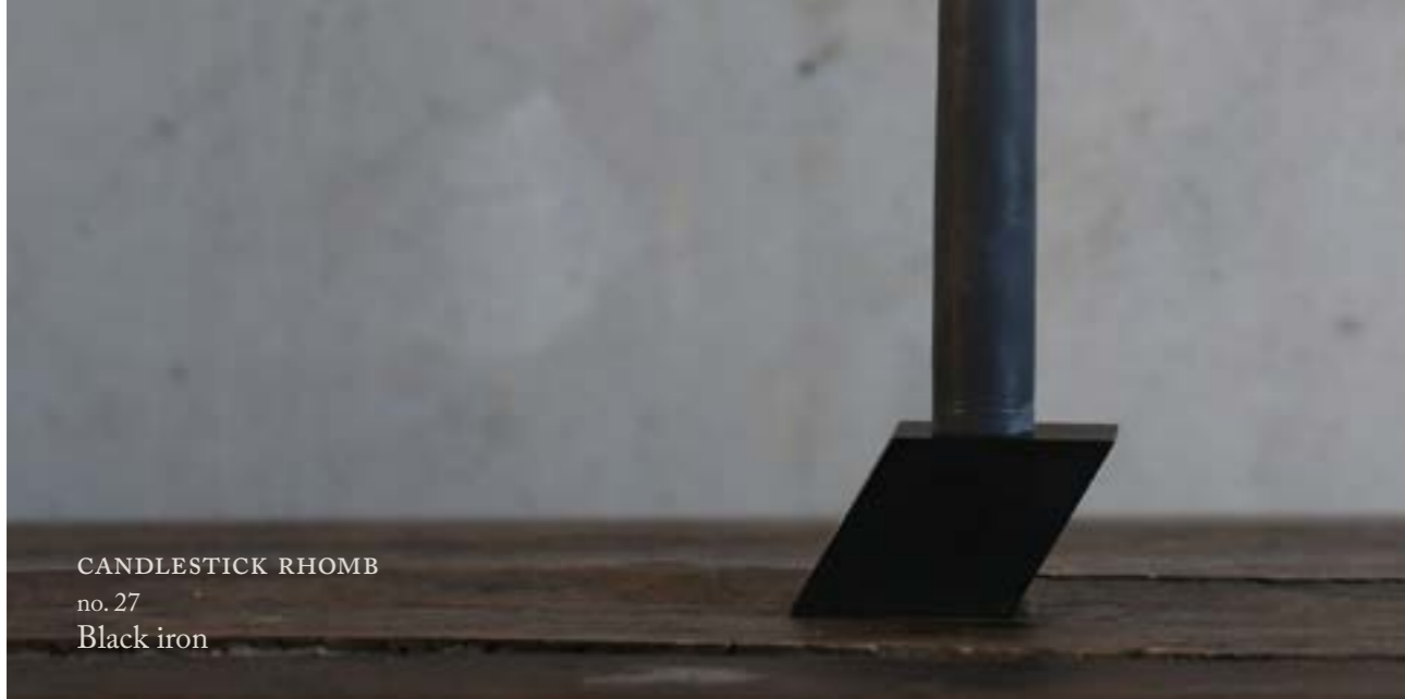
CANDLESTICK RHOMB no. 27 Black iron