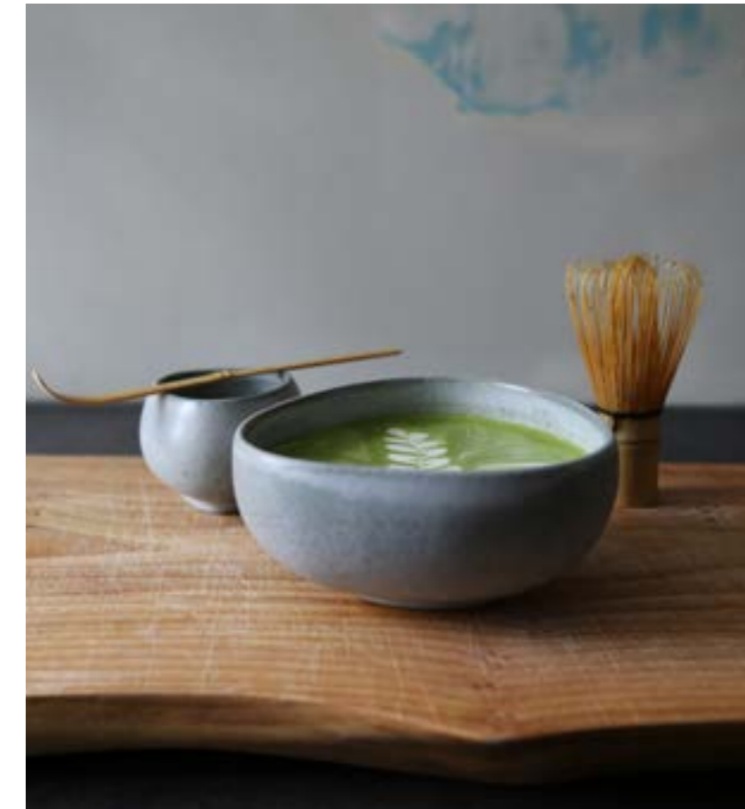
BOWL no. 7 & 8 Ash grey

The Ro Collection Matcha Tea Ceremony performed by a true Italian barista with Japanese matcha powder, and hot Danish milk in an Ash grey Bowl no. 8