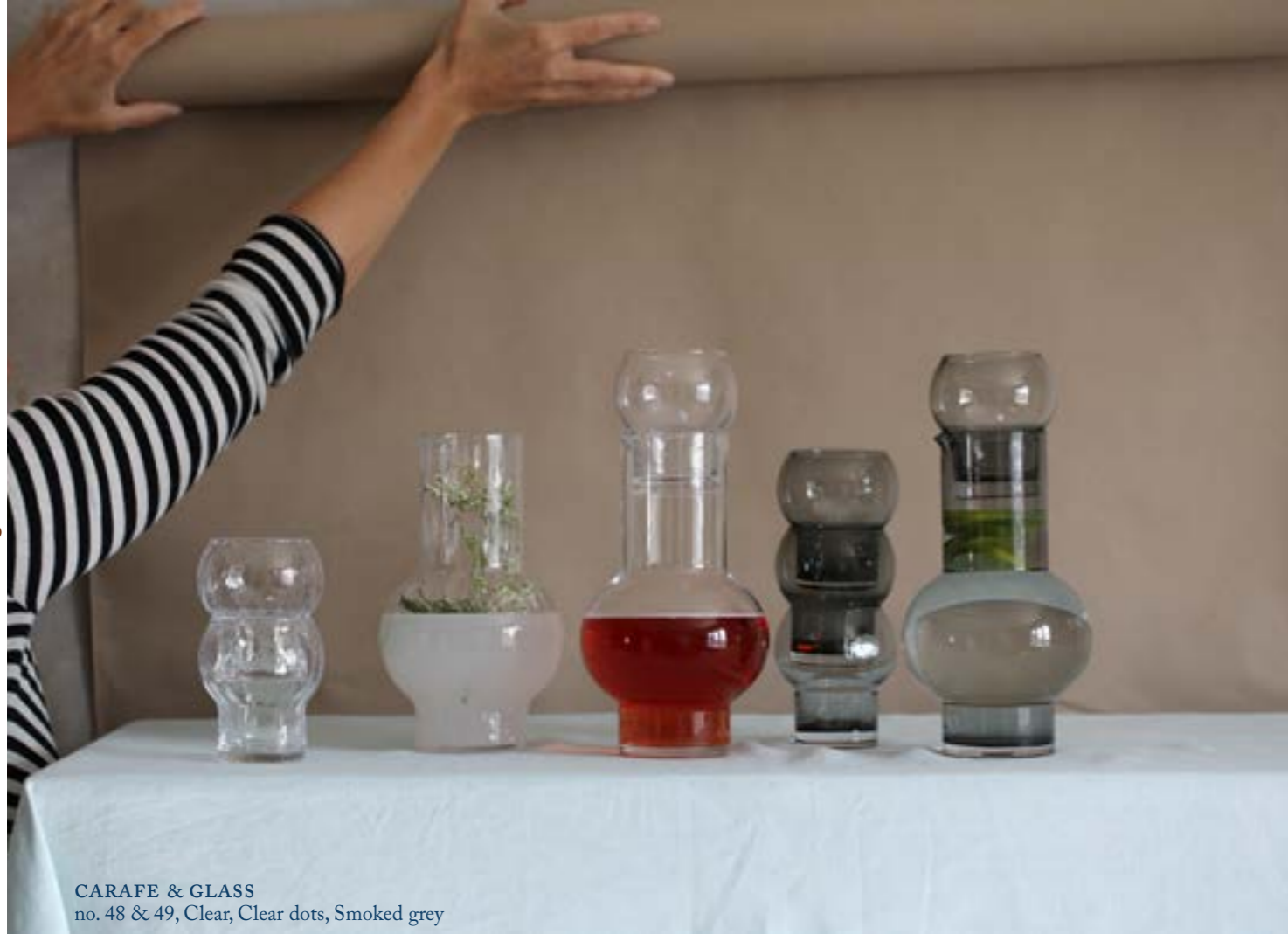
CARAFE & GLASS no. 48 & 49, Clear, Clear dots, Smoked grey