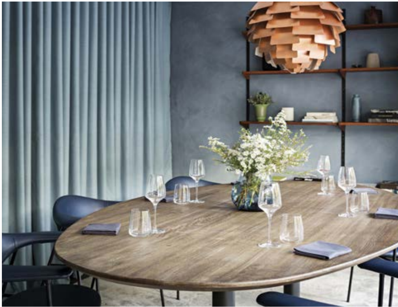
HURRICANE no. 25, Smoked grey gold and Clear FLOWER VASE no. 1,2 and 23, Indigo blue