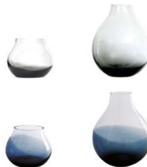
FLOWER VASE no. 1