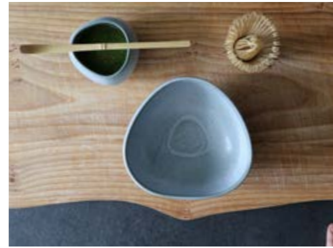
BOWL no. 7, 9 Ash grey