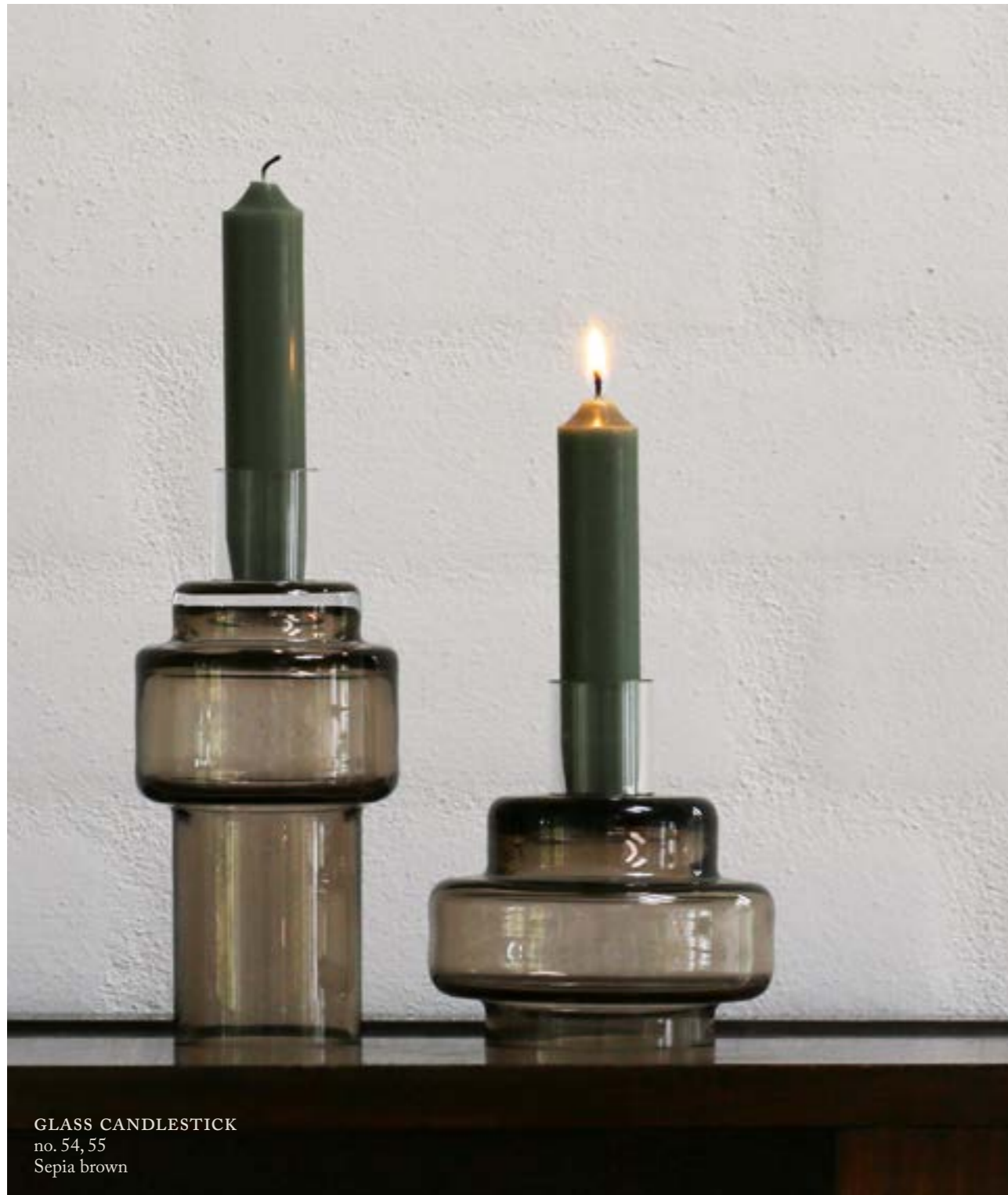
GLASS CANDLESTICK no. 54, 55 Sepia brown