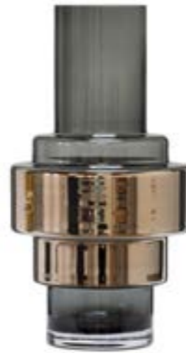
HURRICANE no. 45