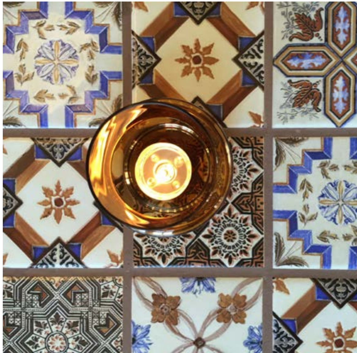
HURRICANE no. 25, Amber CUP, MUG & PLATE no. 33, 34, 35, Slate grey BOWL no. 8, Ultramarine

DREWSSENS CAFÉ, WINE & TAPASBAR SILKEBORG