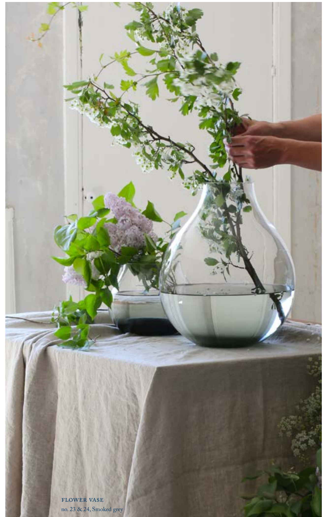
FLOWER VASE no. 23 & 24, Smoked grey

Ro Collection is the courage to set the bar high and to transform imaginative emotions into aesthetic design that creates value in our lives. All the objects serve a functional purpose that appeals to our aesthetic sense, while simultaneously providing a long lasting perspective.