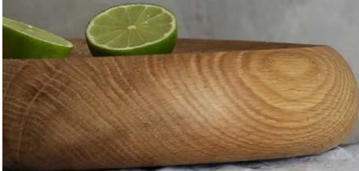
OAK PIECE no. 32