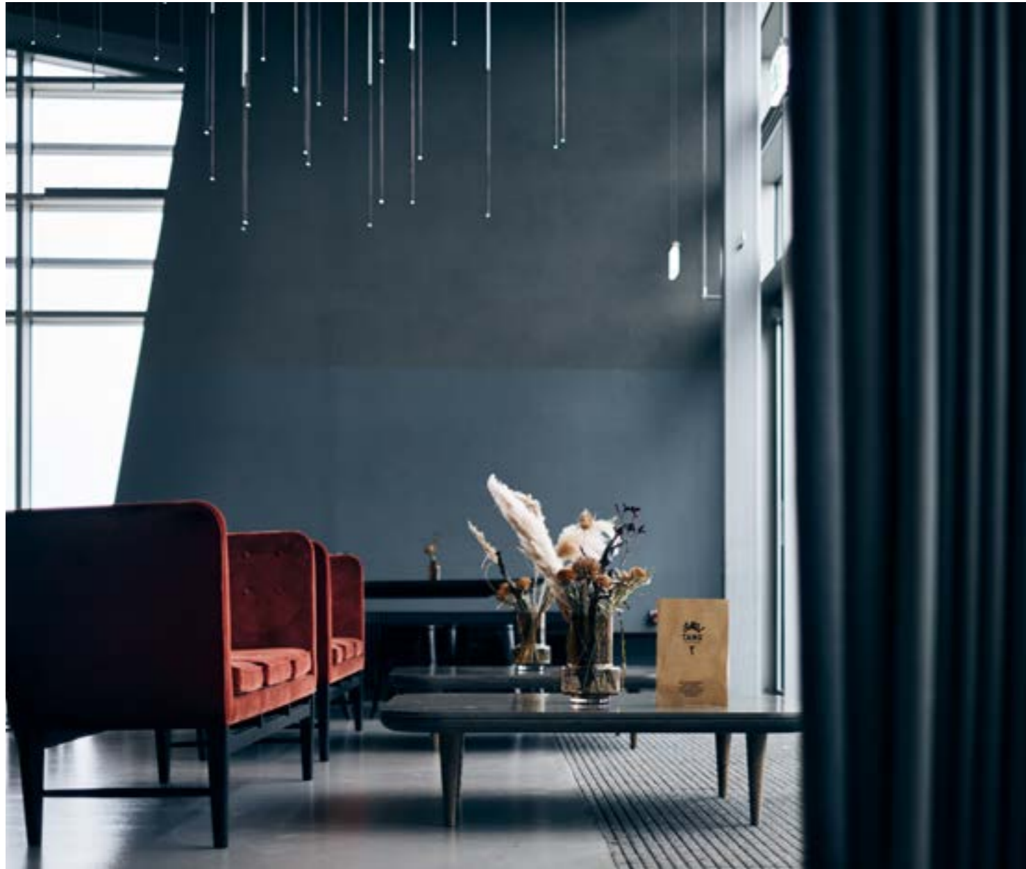
HURRICANE no. 26, Amber