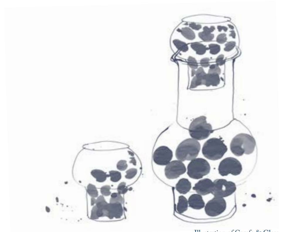
Illustration of Carafe & Glass