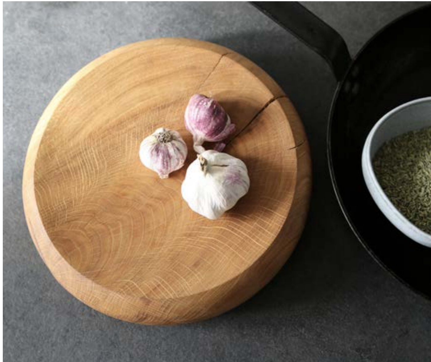
OAK PIECE no. 32 Nature