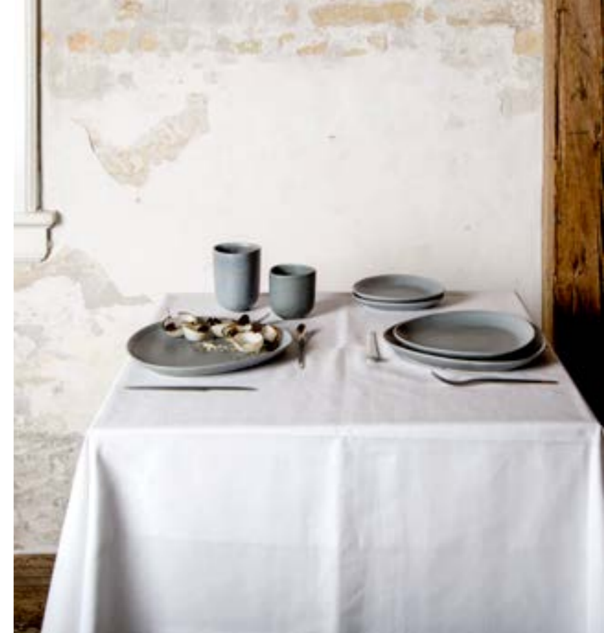
Cup, Mug and Plate no. 33, 34, 35, Slate grey RESTAURANT 56 GRADER, COPENHAGEN