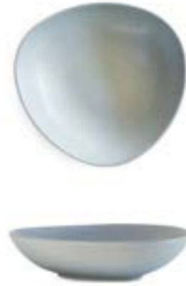
PLATE no. 33