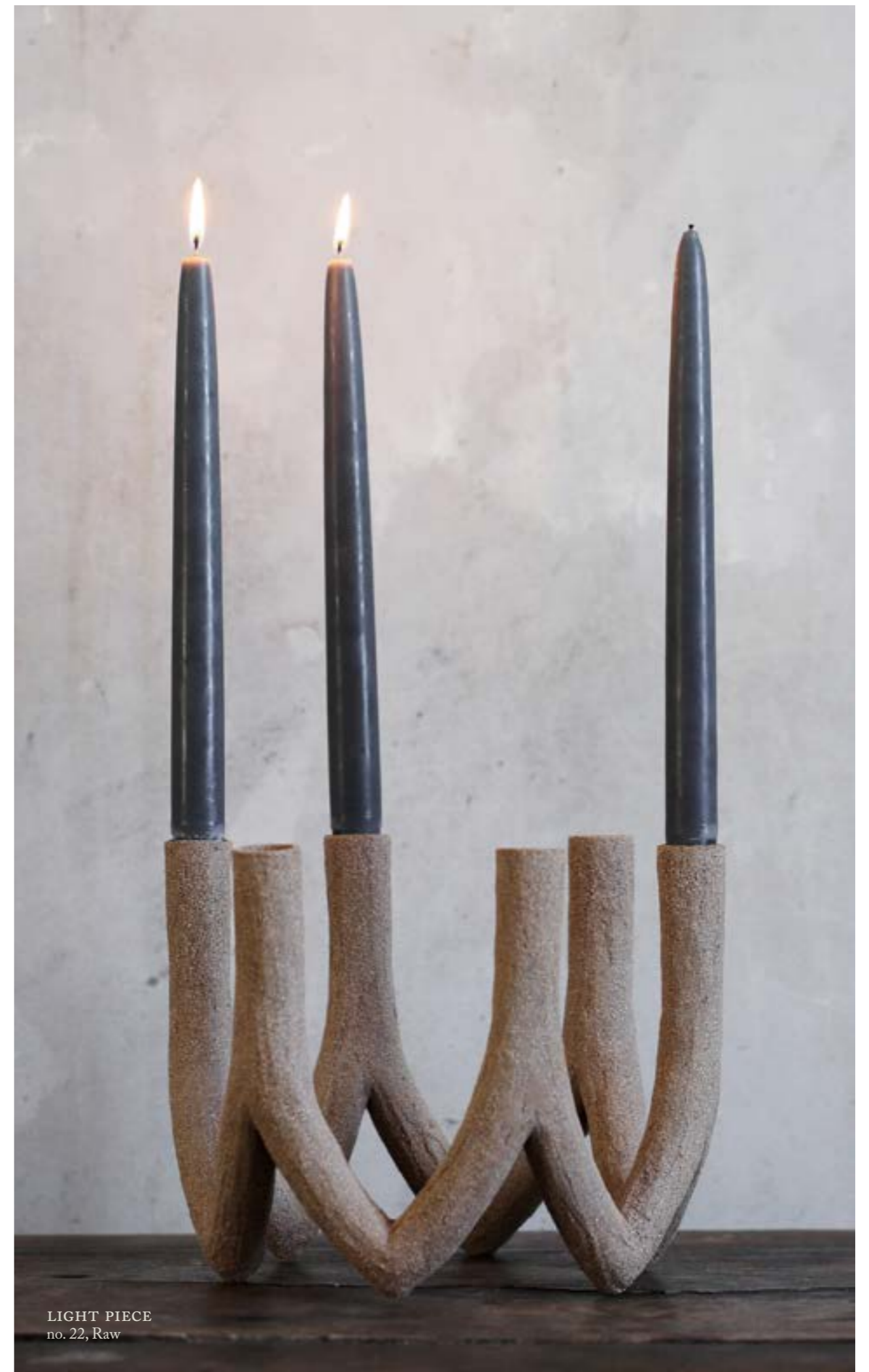
LIGHT PIECE no. 22, Raw