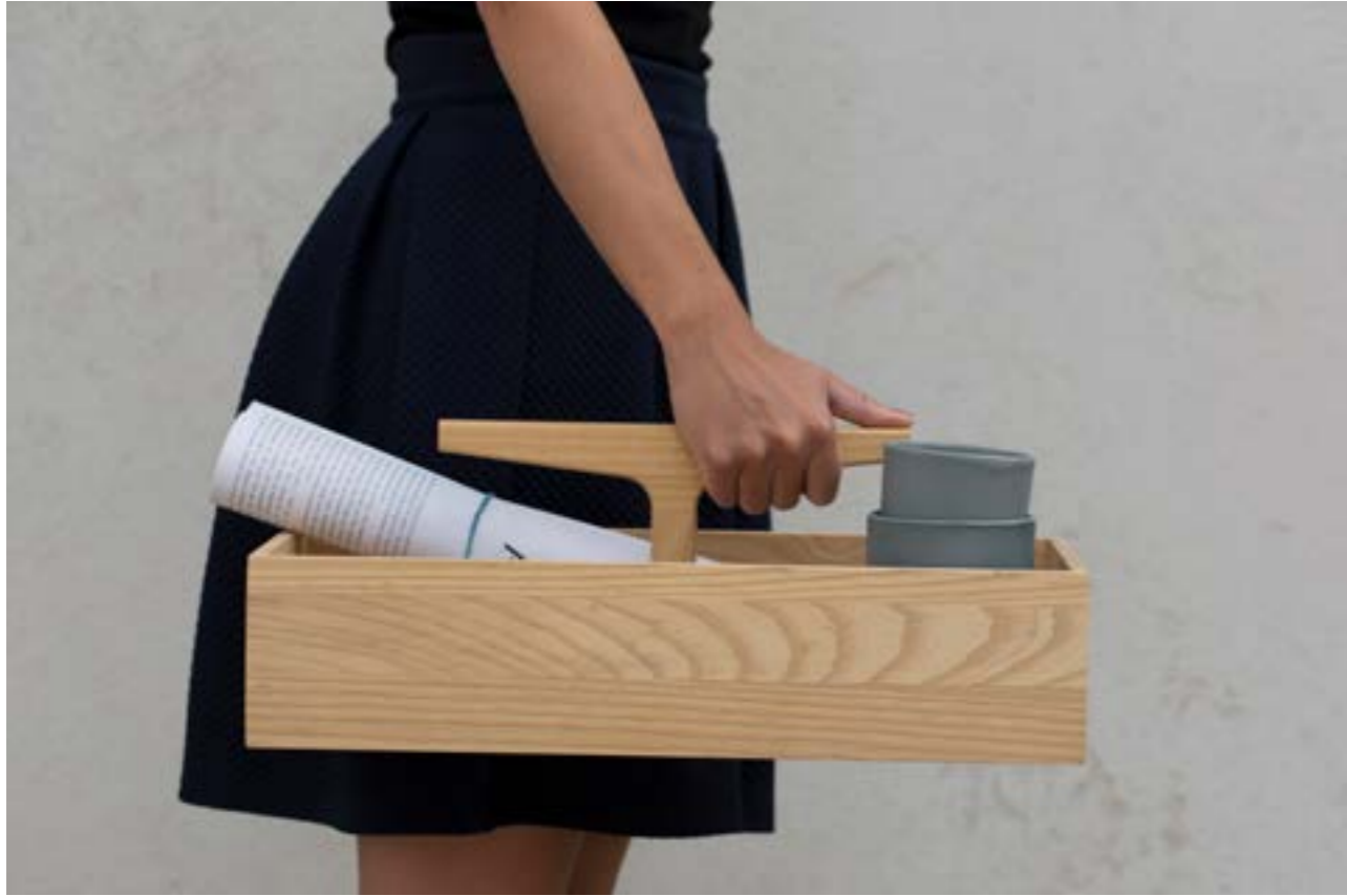
TOOLBOX no. 4, Nature CUP no. 36, Slate grey