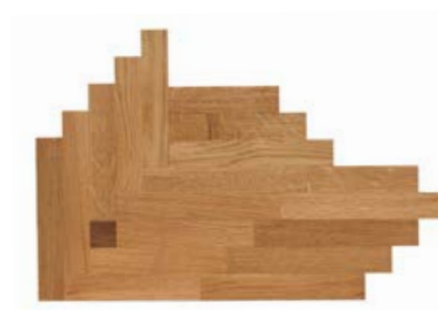
TABLE PIECE no. 40