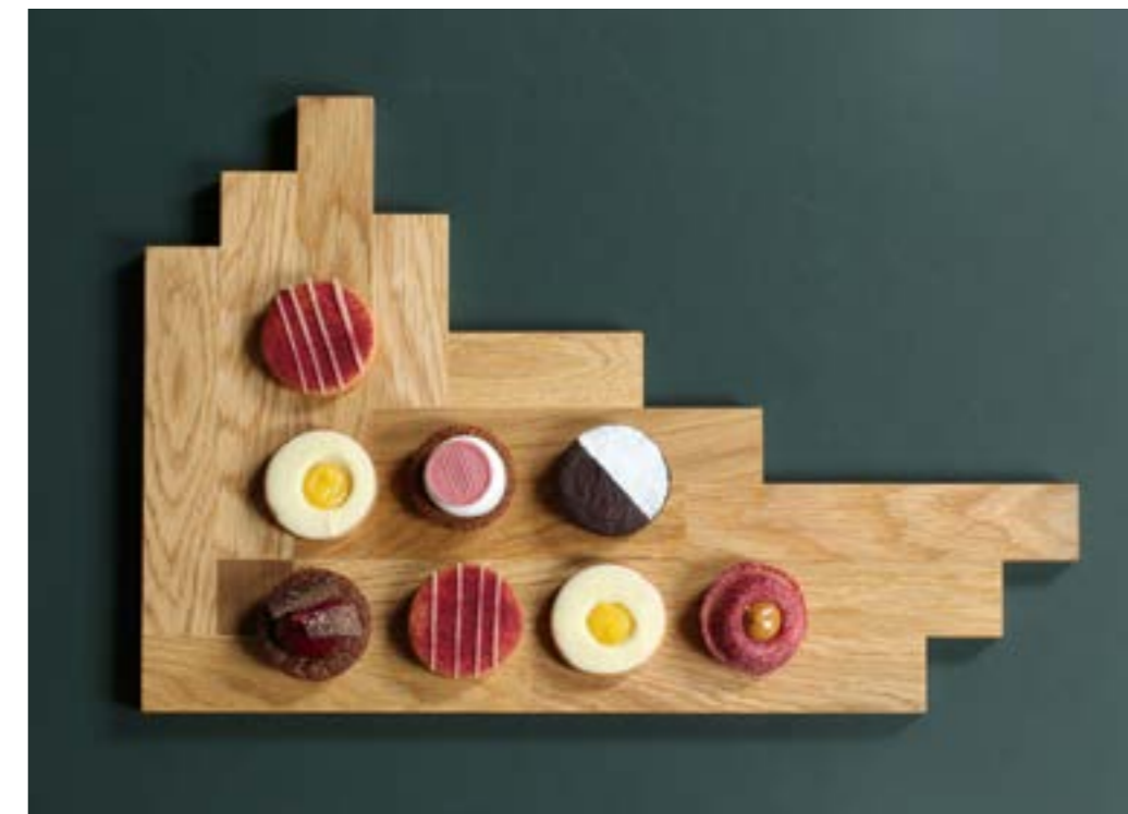
TABLE PIECE no. 41 Nature