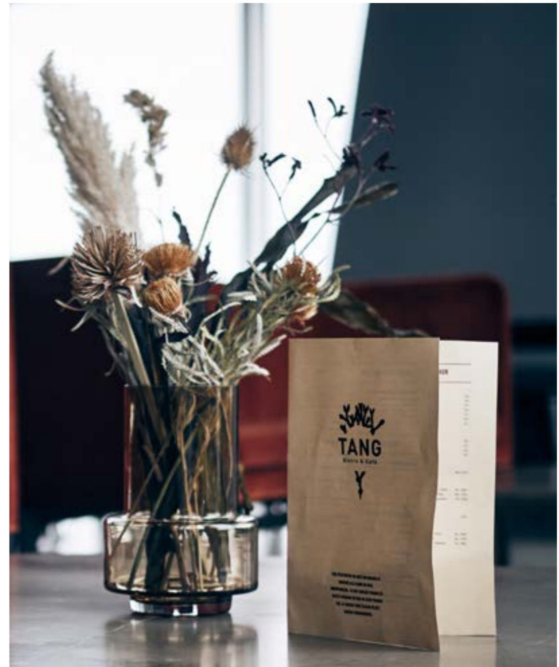
RESTAURANT TANG, DEN BLÅ PLANET COPENHAGEN