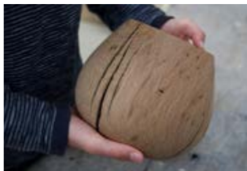
All the Oak Pieces have their own life, cracks and variations in the grains.