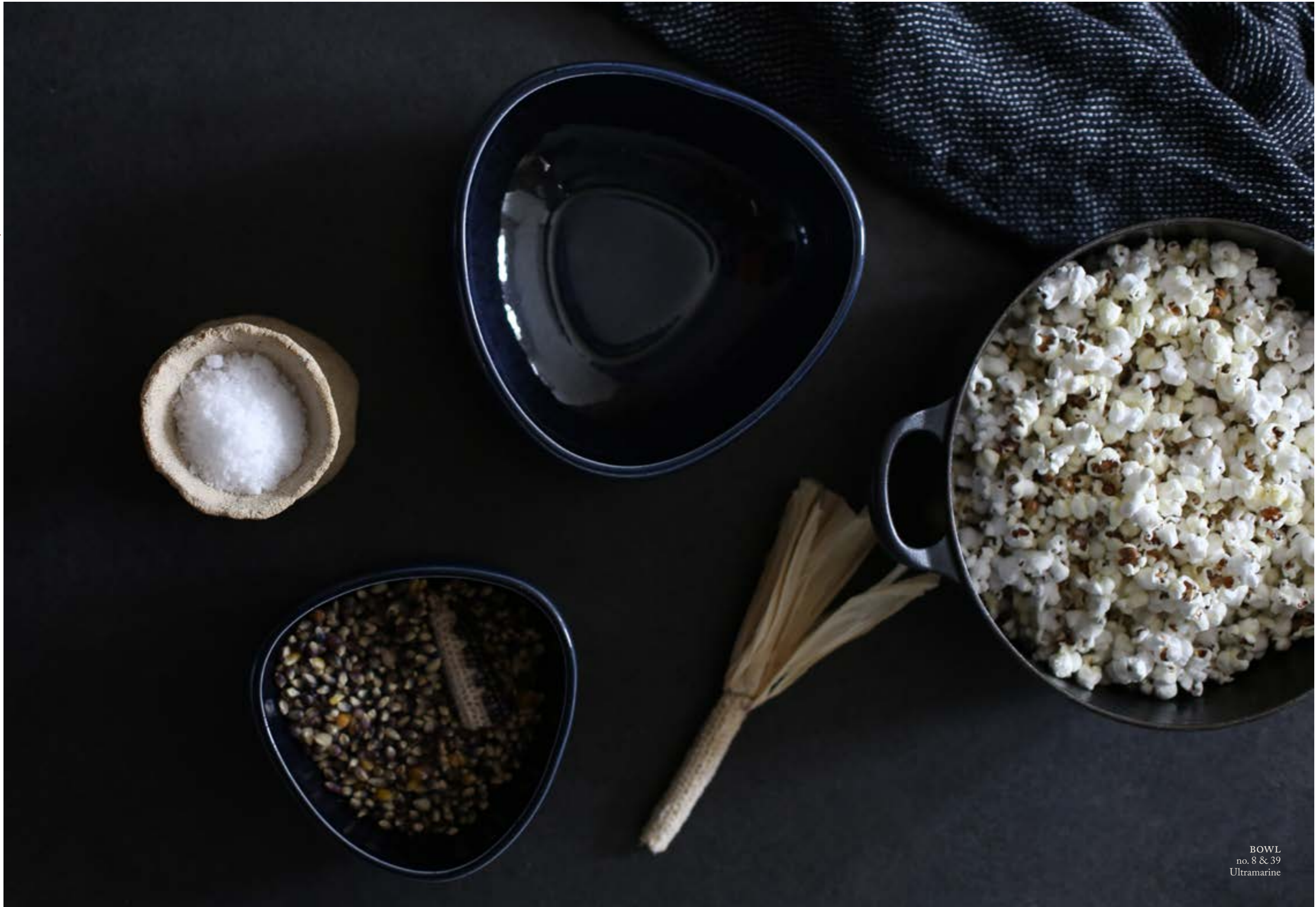
BOWL no. 8 & 39 Ultramarine