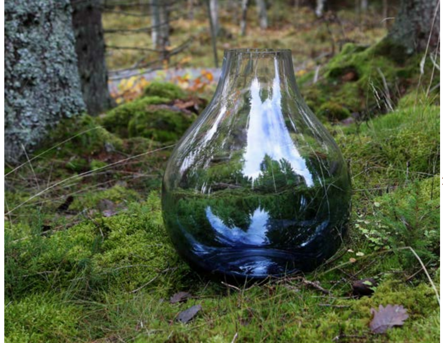
FLOWER VASE no. 24, Indigo blue

All our glassware are handblown pieces. Crystal clear glass and coloured glass are melted together. The glassmaker blows the melted glass into a mould. Their colours are reminiscent of antique chemist jars, bottles and fine art pieces in Smoked grey glass and held in colour tones of the surrounding nature of Denmark — the clear blue sea, the amber and grey stones from our coast, purple from the heathlands.