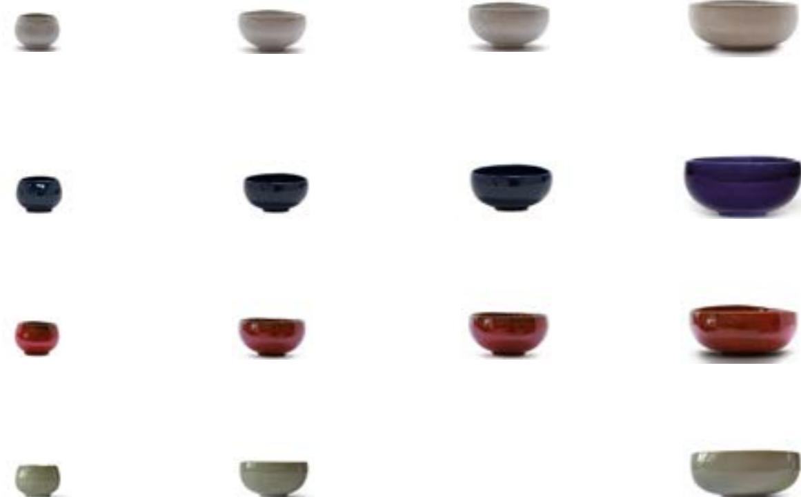
BOWL no. 7