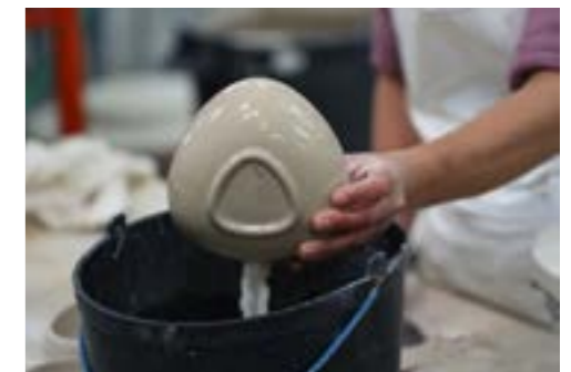
The hand casted bowl, still in soft clay, is born out of the mould.