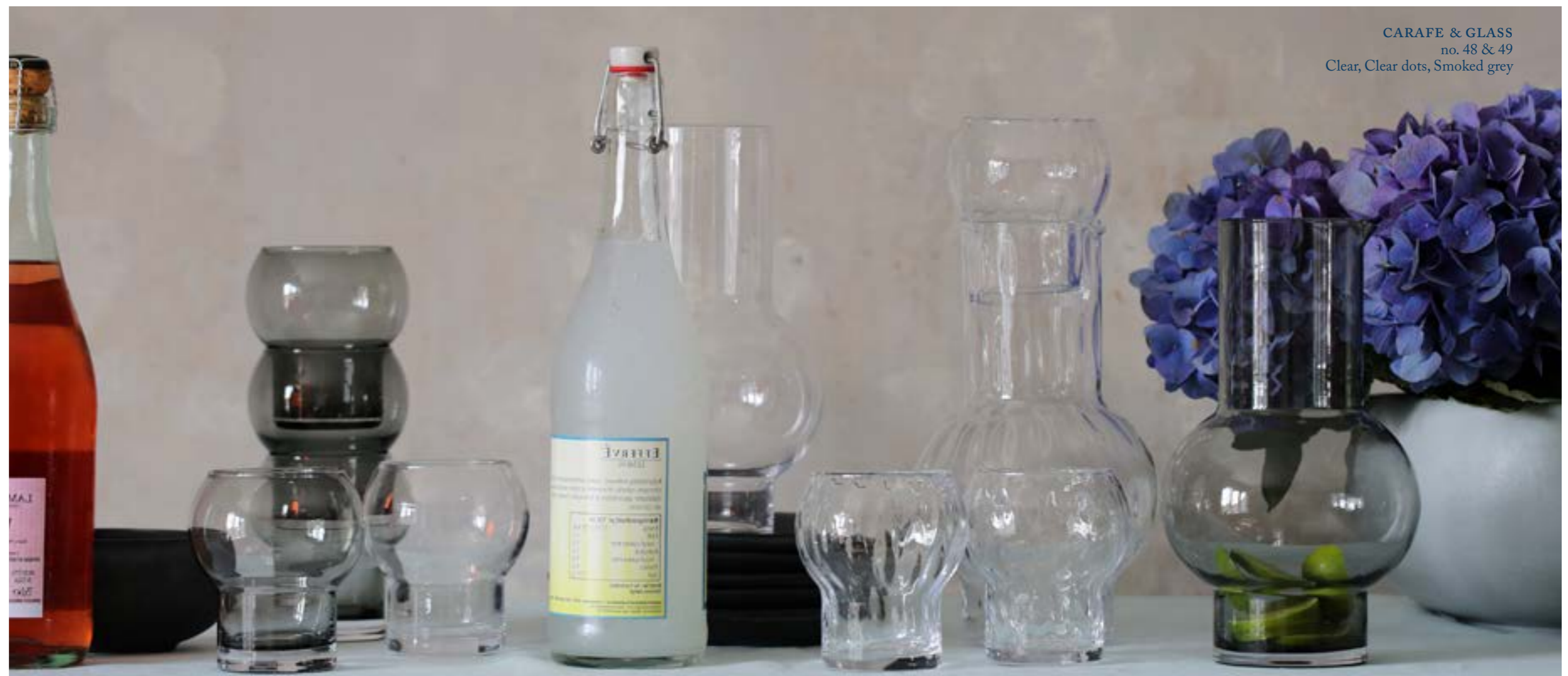
CARAFE & GLASS no. 48 & 49 Clear, Clear dots, Smoked grey

A pure and clear version, an elegant classic Smoked grey and a sophisticated version blown in optical honeycomb pattern of dots scattered in the hot glass. This traditional craft technique makes each piece different. The top rim may be wavy and the pattern random scattered.