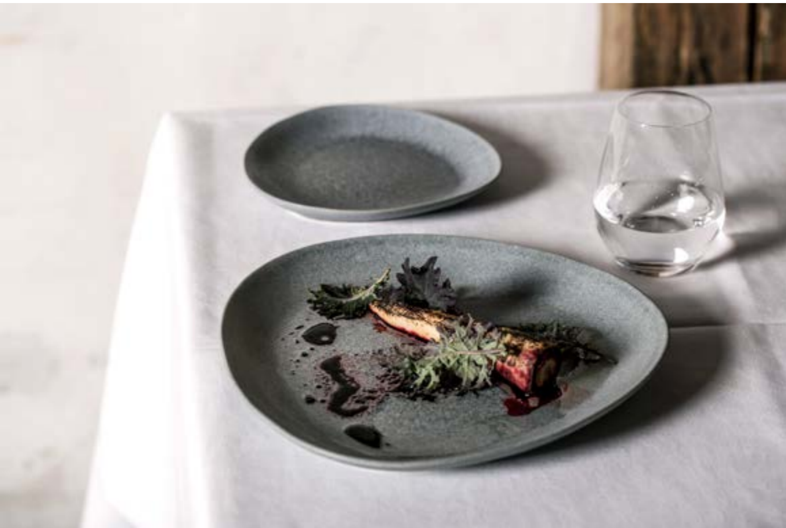
CUP, MUG & PLATE no. 33, 34, 35 Slate grey BOWL no. 7 Chromium green