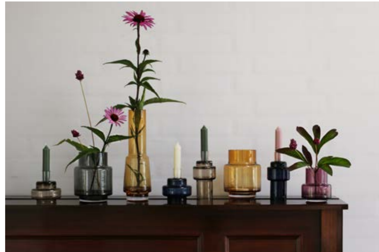
GLASS CANDLESTICK no. 54, 55 Sepia brown, Indigo blue