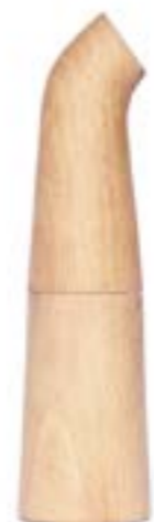
MILL no. 1