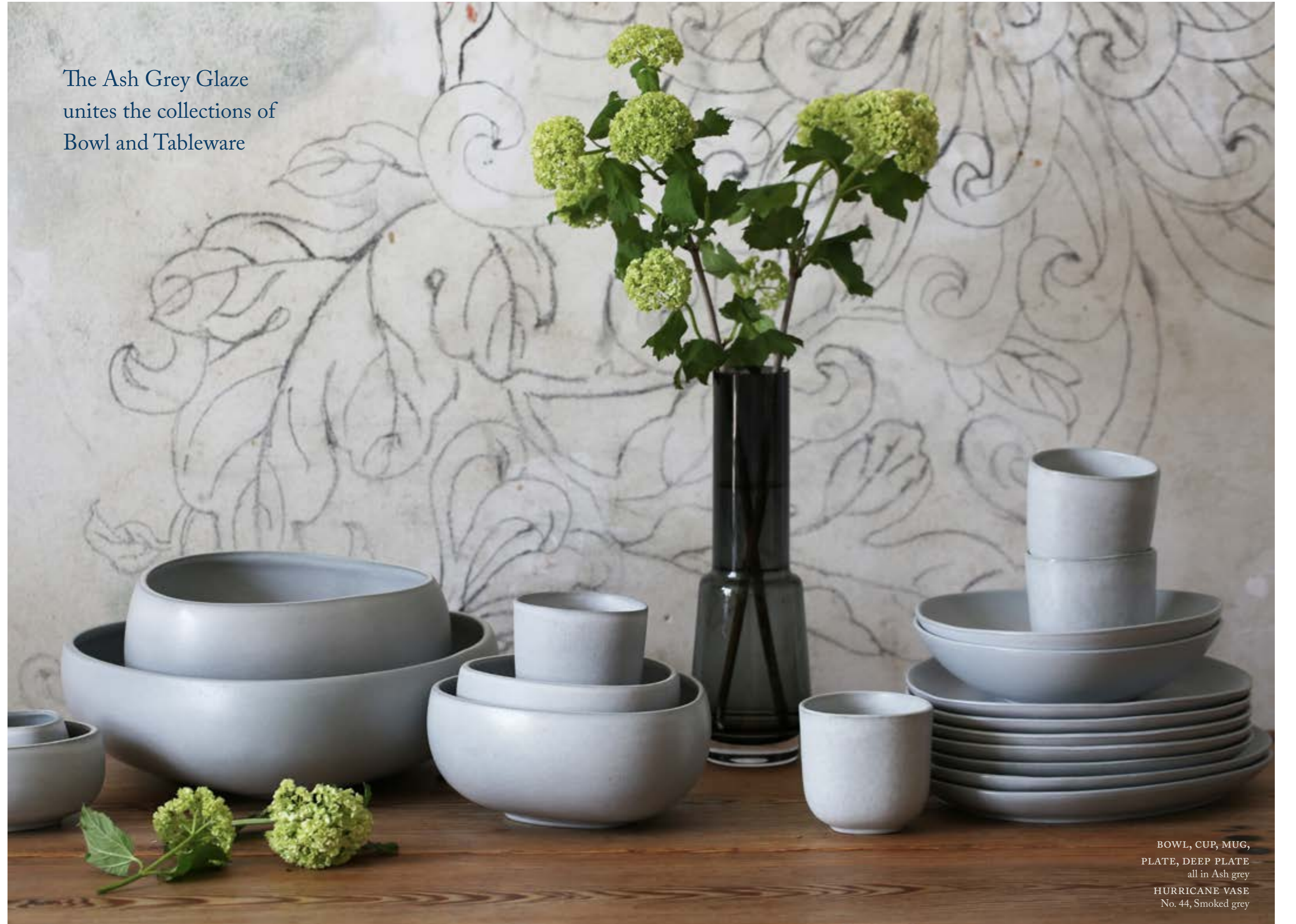
BOWL, CUP, MUG, PLATE, DEEP PLATE all in Ash grey HURRICANE VASE No. 44, Smoked grey

The Ash Grey Glaze unites the collections of Bowl and Tableware