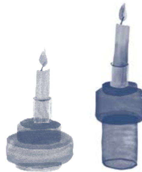
HURRICANE no. 53, 26, 44 Amber, Smoked grey, Heather

Illustration of Glass Candlestick no. 54 and 55 for the packaging. Our packaging is made of 100% recycled cardboard and printed in dark blue colour.