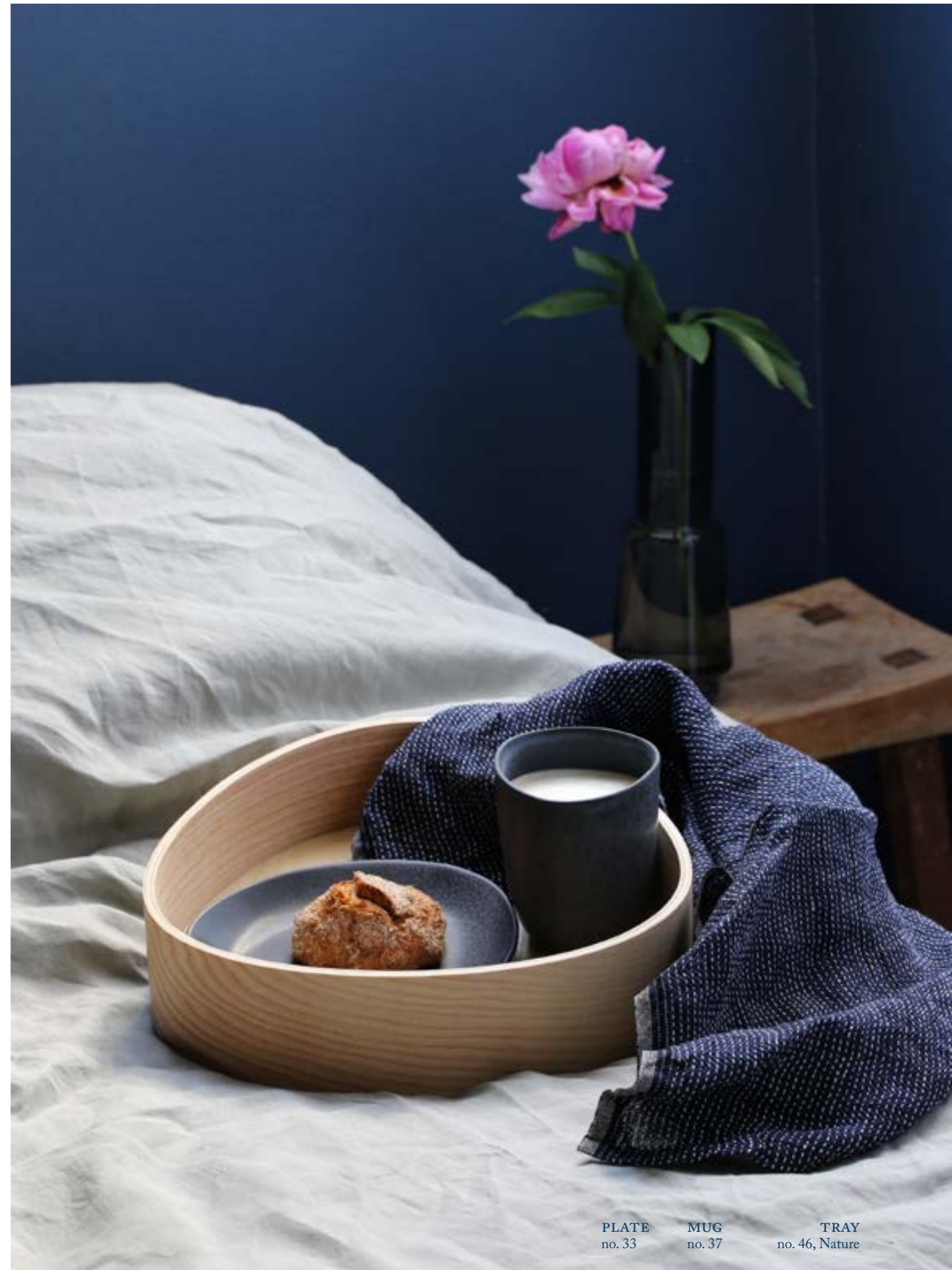
PLATE no. 33