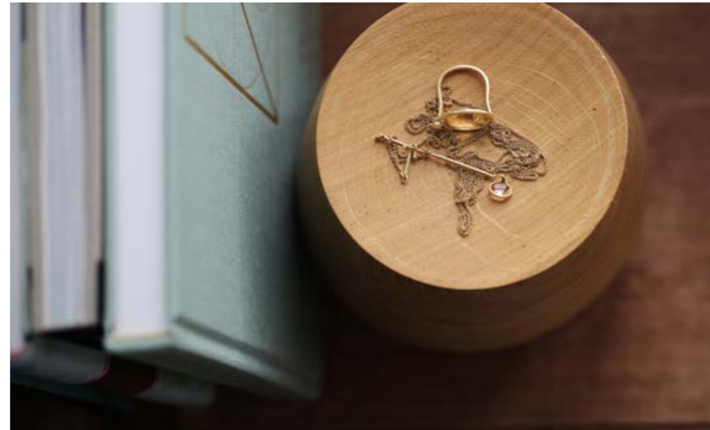
OAK PIECE no. 31 Nature