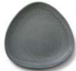
PLATE no. 33