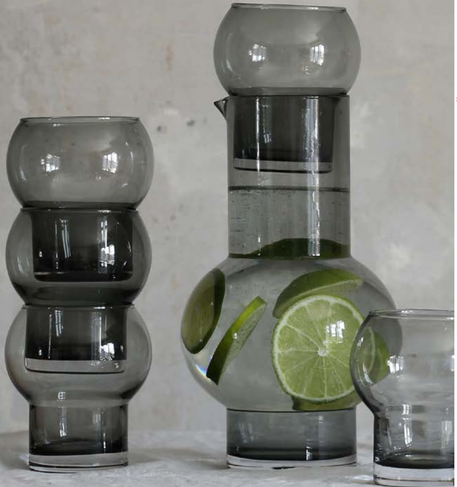
CARAFE no. 49, Smoked grey GLASS no. 48, Smoked grey