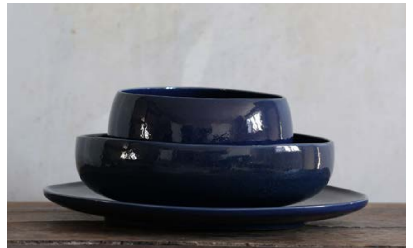
BOWL no. 9, 10 & 11 Ultramarine