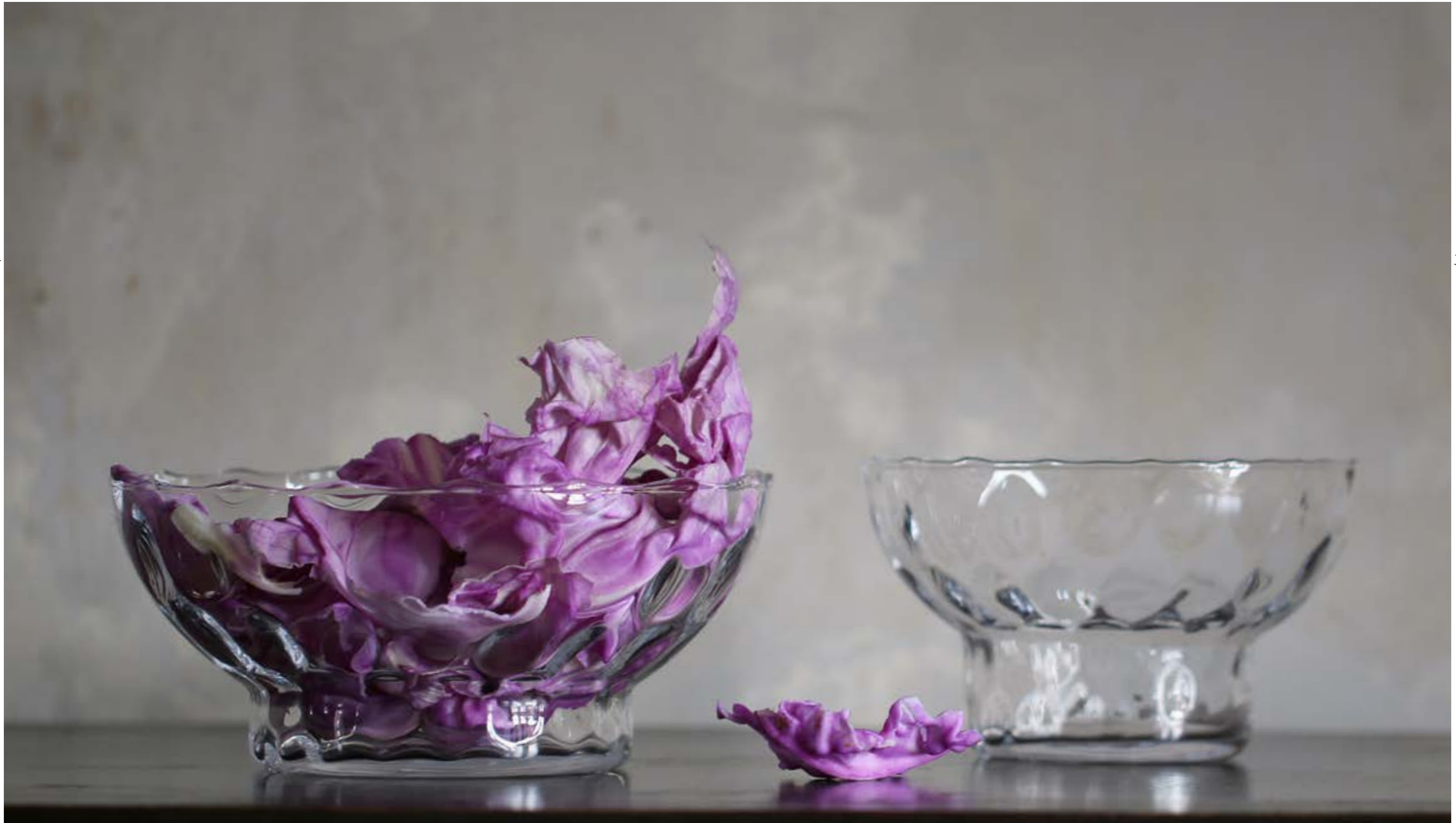
GLASS BOWL no. 51, Clear dots

The pattern of dots scattered in the glass. This traditional craft technique makes each piece different. The top rim is wavy and the dots random scattered.