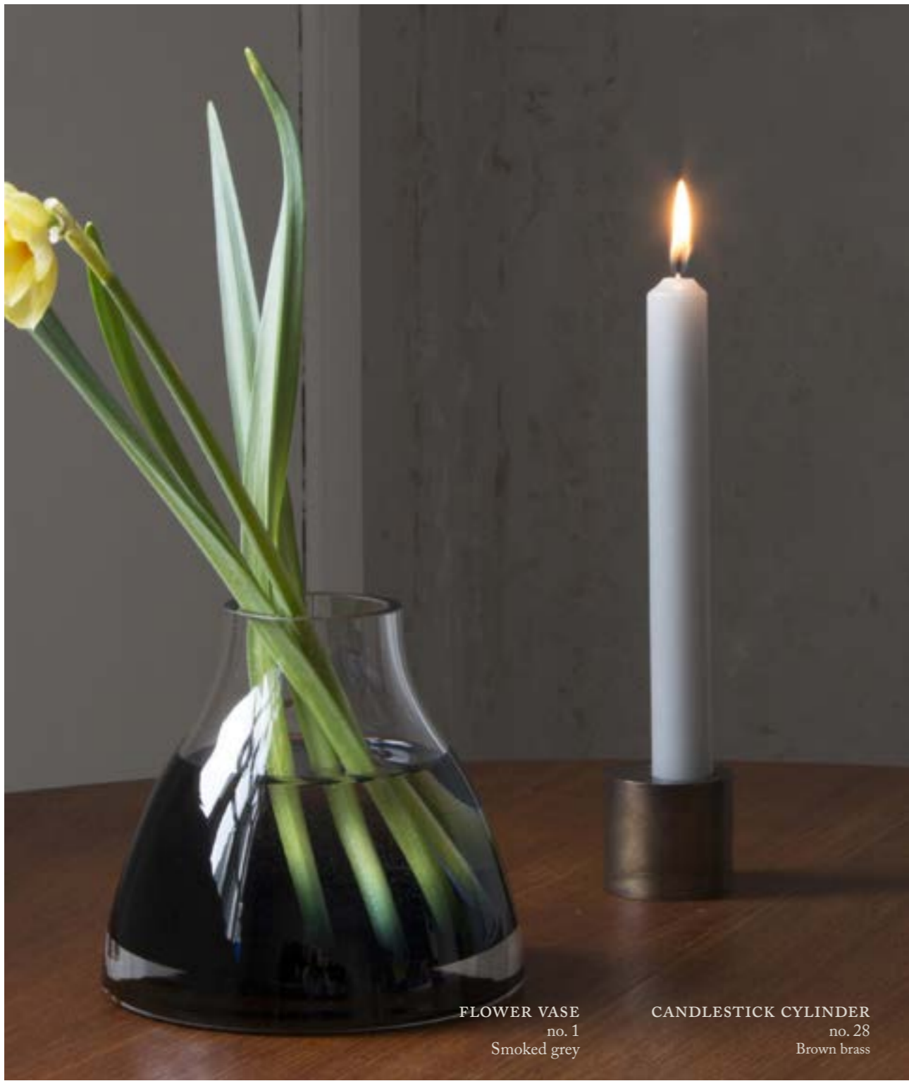
FLOWER VASE no. 1 Smoked grey