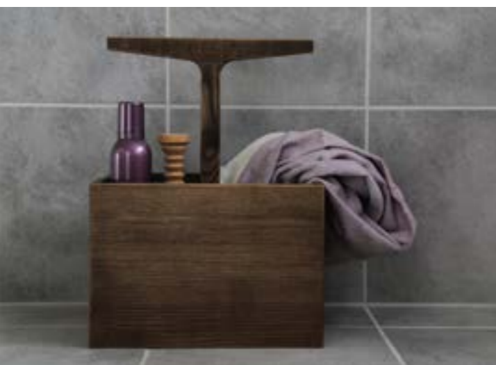
TOOLBOX no. 4, 5 Tint