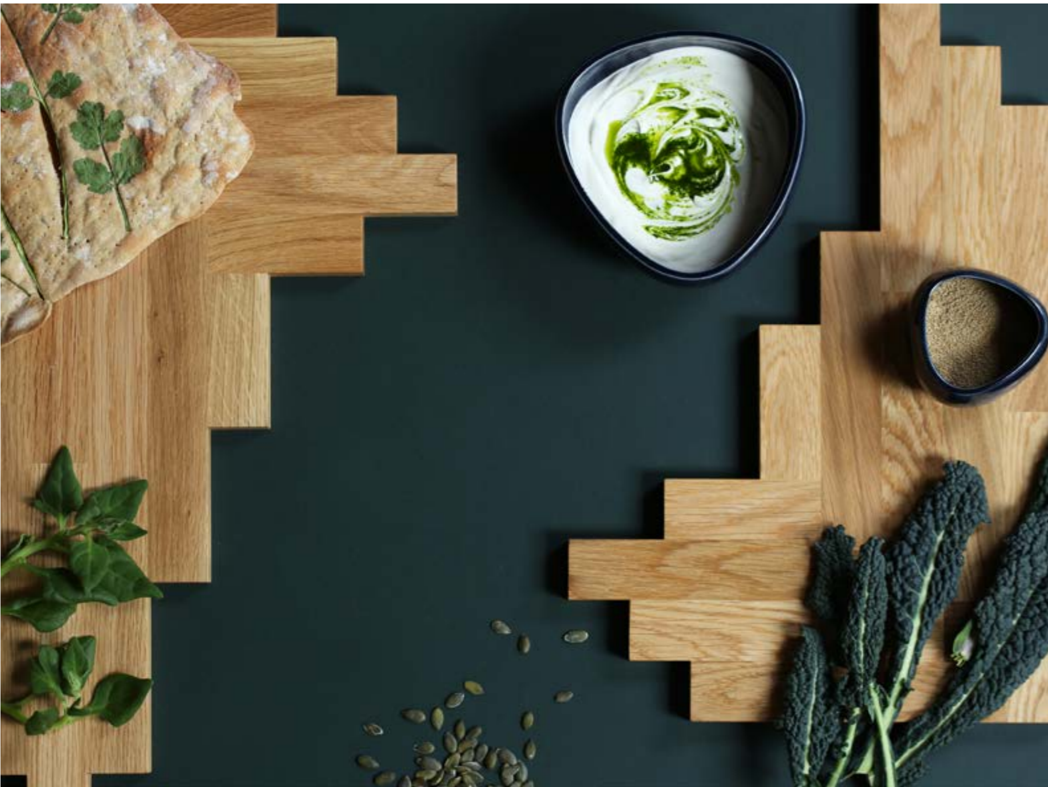
TABLE PIECE no. 41, 42 Nature